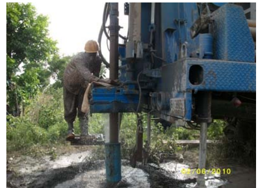
Testing the flow rate of the new borehole in Nyobido—30 liters per minute!

We are also leading a Home Care Group for our Ghanaian church now, which has been a great way to get to know other members better as we study Scripture together!