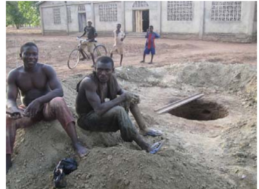
Just finished—a new well at the Vieri Methodist Church. The well was later capped with concrete to protect it from contamination.

bassy for some waterline extensions in the Tamale area.