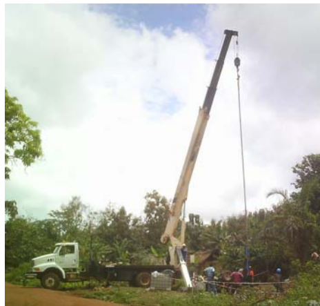
Pulling the stuck drill pipe at Yawsae.

The biggest challenge has been with my drill rig. The crew and I went to Yawsae in western Ghana in October to drill a borehole for the Methodist clinic. This project should have taken about a week, but that was not to be. On our first attempt, we sited the borehole and started drilling—no problems the first day, but the second day we returned only to find the drill pipe stuck in the clay of the borehole. A week or so later, we were able to get a crane from the Newmont gold mine nearby to come and pull our pipe out. In December we returned to finish the borehole. Drilling was going well, and we hit water at about 140 feet—quite a celebration! But short-lived as we were beset by seal problems on a motor. Then, in our hurry to pull the pipe, we lost 120 ft of pipe, plus our